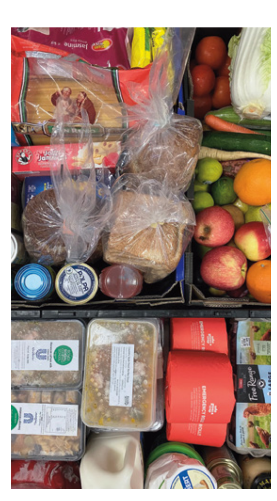
Insights and outcomes from this report will be launched to the public in due course.